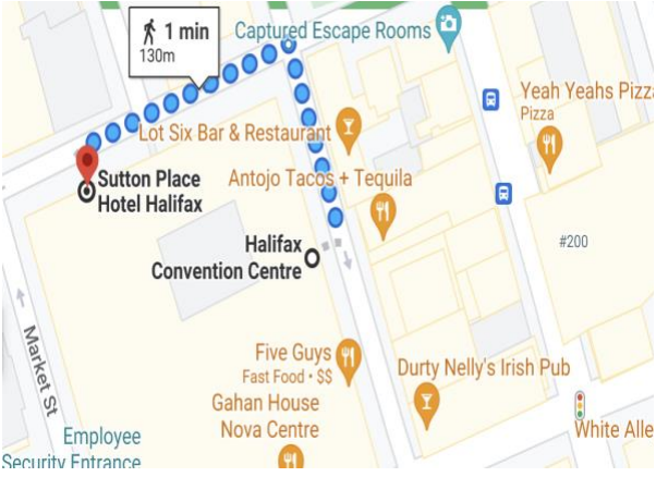
Unison Booking (Booking Code: Unison23)